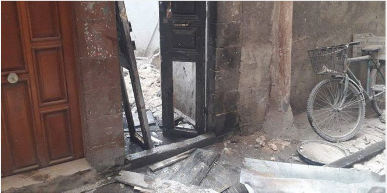
A scene from the aftermath of one of the attacks