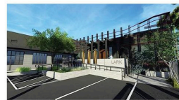
Lark Cultural Annex, Exterior Rendering