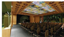
Lark Cultural Annex, Interior Rendering