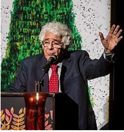
Loris Tjeknavorian speaking in Cheragh Khamosh Nist conference in Iranshahr Hall in Tehran