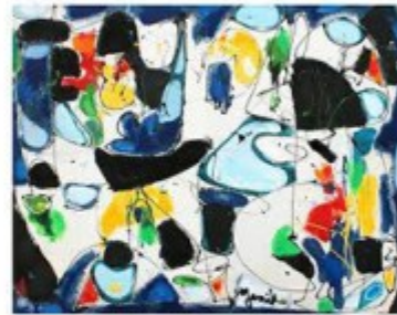
"Untitled, 57.5x47", oil on canvas