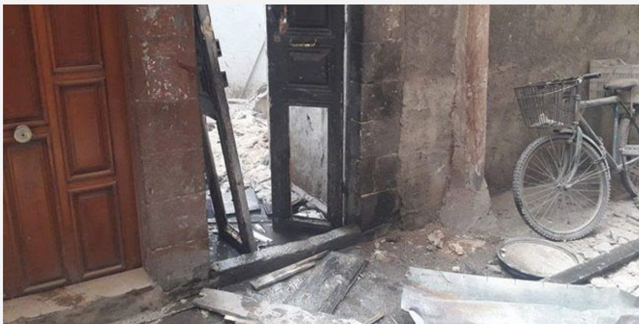
A scene from the aftermath of one of the attacks